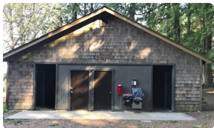
Main Camp Bathrooms & Showerhouses