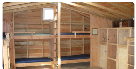
Typical Main Camp Cabin Interior

Main Camp cabins are off grid, rustic, and are located on the beach or nestled among the trees. Fully enclosed, these have bunk beds for 12 guests and cubbies to store your belongings. Participants provide their own linens. Bathroom facilities with showers are a short walk away. Most cabins do not have electricity. If you require electricity for medical reasons, please inquire about availability during registration. Cabins are shared with other families. You can request another family through your registration in UltraCamp.